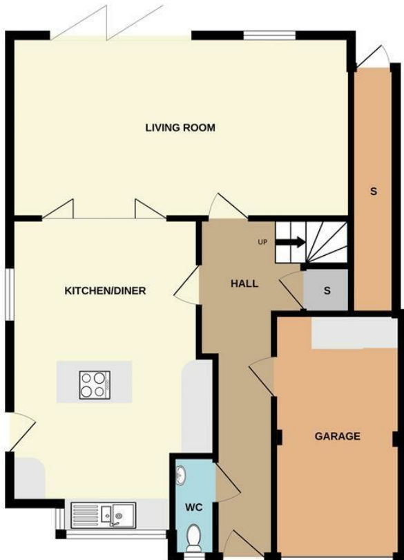
1st Floor 678 sq.ft. (63.0 sq.m.) approx.